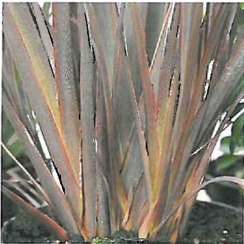
11. Phormium tenax 'Bronze Baby' – "New Zealand Flax"