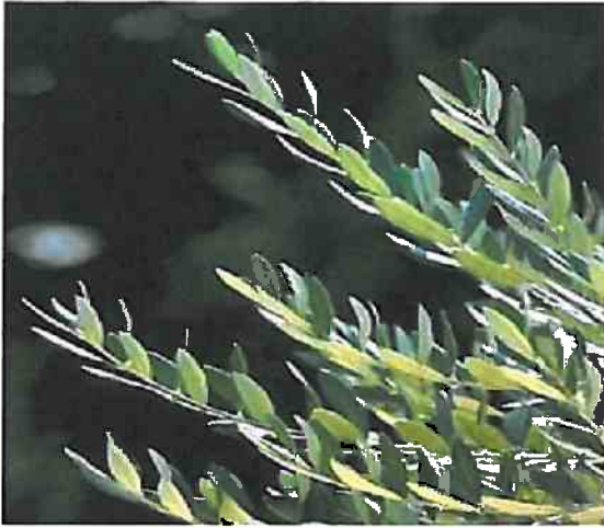
7. Olea europaea 'Little Ollie' – "Dwarf Olive"