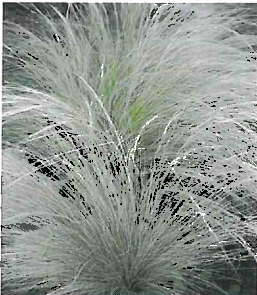
12. Nassella tenuissima – "Mexican Feather Grass"