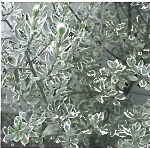
5. Rhamnus alaternus 'Variegata' – "Variegated Italian Buckthorn"