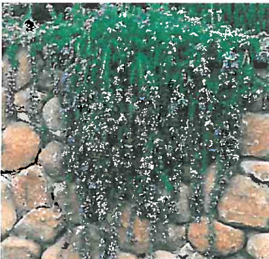
9. Rosmarinus officinalis Irene