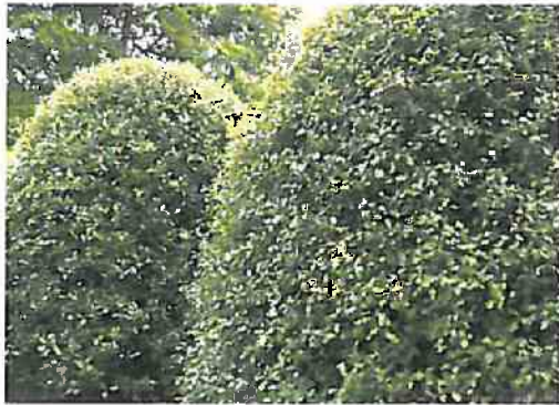
10. Pittosporum tenuifolium 'Silver Sheen'