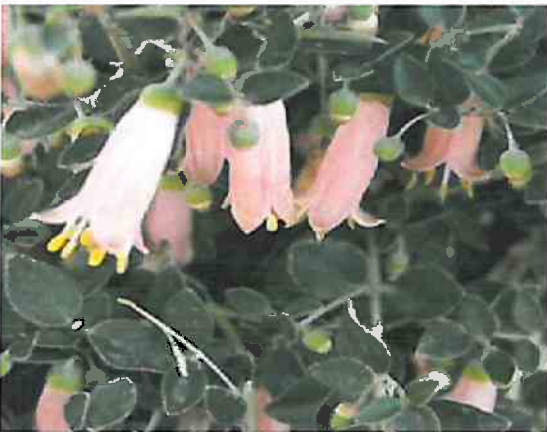
8. Correa pulchella 'Pink Eyre' – "Australian Fuchsia"