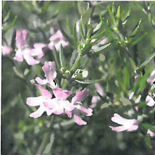
4. Westringia fruticosa 'Wynyabbie Gem' – "Coast Rosemary"