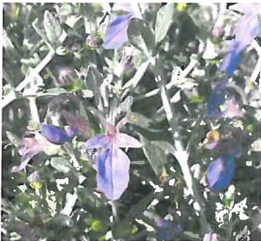
6. Teucrium fruticans – "Bush Germander"